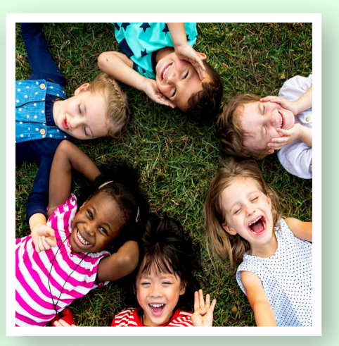
FOUND HER SOME NEW FRIENDS.